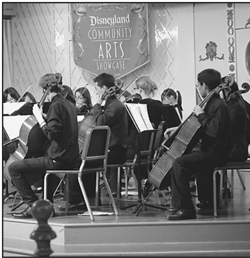
VALENCIA PERFORMS WELL DURING THEIR CONCERT.

The plaza was filled with an audience ready to listen to the musical talent of all of the performers that were scheduled to play for them. Out of a total of four schools, our school was last to perform but definitely not the least talented.